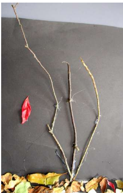
Left and following pages: Autumnal artwork by Room 3 students