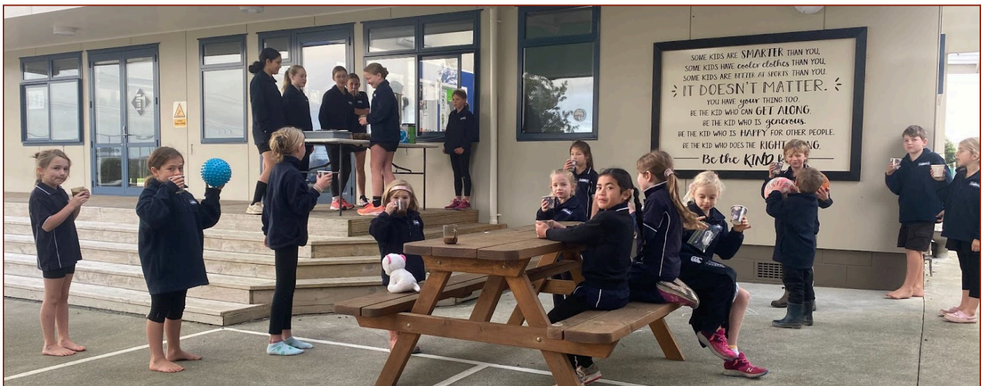
Above: Students enjoying their Milos on the deck. Thank you to Marton Christian Welfare for donating the Milo.