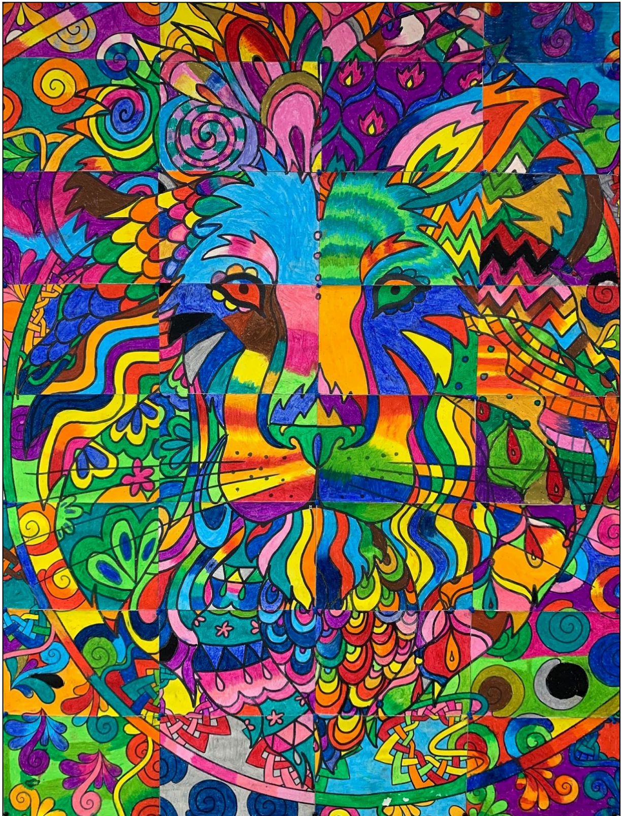
“The Library Lion” - Collaborative art created by Room 5.