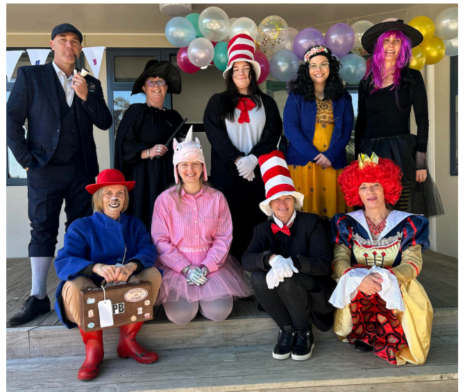
Above: Our staff dressed up as their favourite book characters for our recent Book Week

with thanking the sports coaches who had contributed to their teams each week during the winter. What was really special was the students sharing what they loved about participating in each sport. Letting us know they loved developing their skills, competing against other teams and playing alongside their peers.