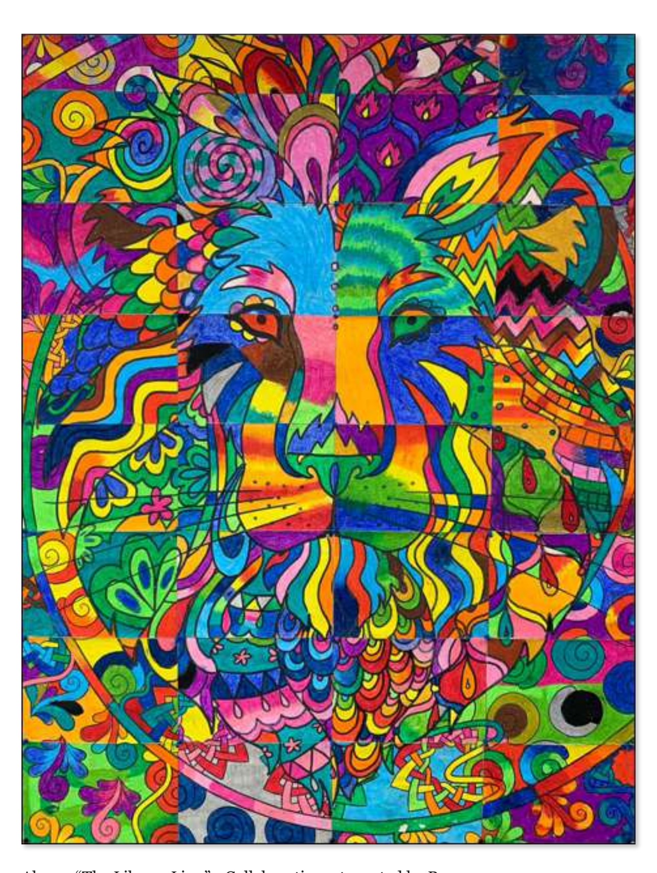
Above: "The Library Lion" - Collaborative art created by Room 5, 2023