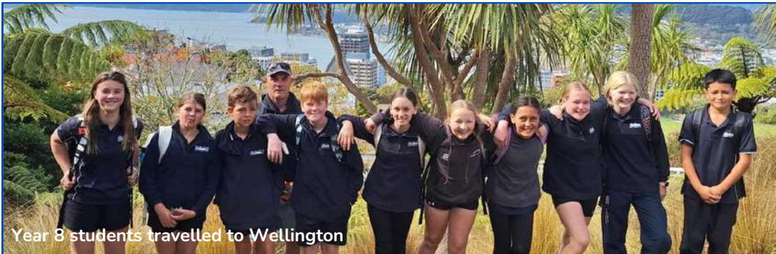
Year 8 students travelled to Wellington

principal@southmak.school.nz 06 327 6617 www.southmak.school.nz